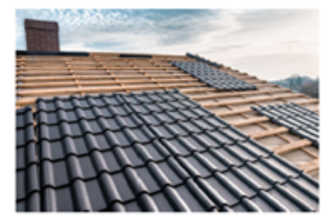
Adding noncombustible roof coverings can help protect roofs from wildfires.