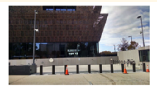
A self-rising flood barrier protects structures by automatically raising the barrier when floodwaters rise.