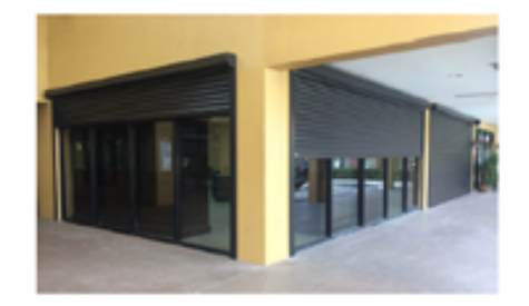
Adding hurricane shutters protects windows against flying debris during high wind events such as hurricanes, tropical storms, or severe storms.